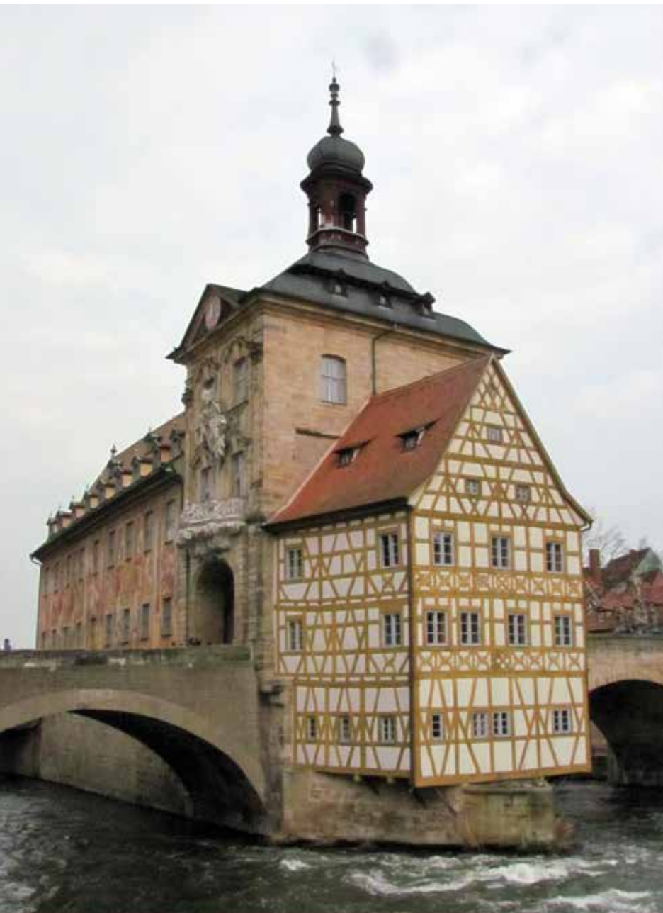
Bisexuality and Baroque - Bamberg's town-hall too is located between the banks

times when the only sex shop in town was pudently called „Specialised shop for conjugal health articles“ have long gone. Surely, gay and lesbian life flourishes mostly in obscurity and is certainly more provincial than in Berlin or other metropolises. Yet, the small and lively scene has something to offer. Plus, since July 2013, a bi group exists in Bamberg.