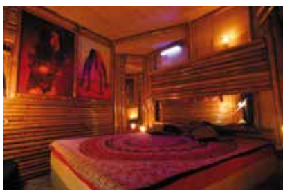
Big Bamboo Room

say „no“, but then a brief touch will not make you gay or lesbian. It's not contagious, either“ (current pricing, women: € 4,99, men: 29,99-39,99€, couples: 19,99-34,99€€).