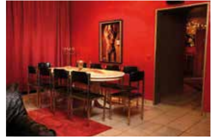
Swingerworld Inside Dinette

Bi guests are welcome at all party events (current pricing, women: 5€, men: 80€, couples: 30-40€€). Guests are free to enjoy their bi preference without any inhibitions. We adhere to the non-smoking law, but there is an outside area with a heated smoking pavilion.