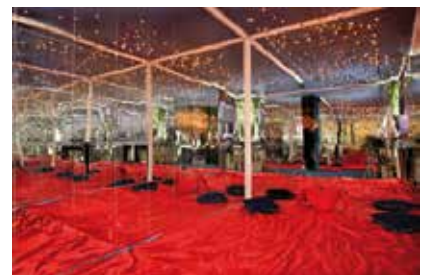
Swingerworld Inside Room of mirrors