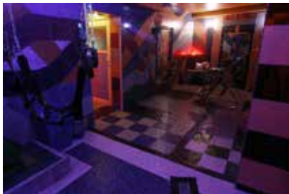
Big Bamboo Wet area