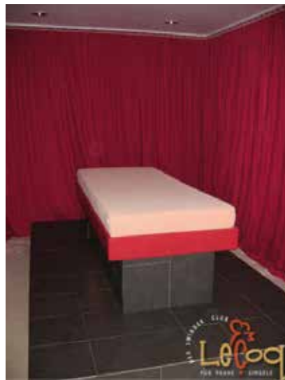
Le Coq Playground