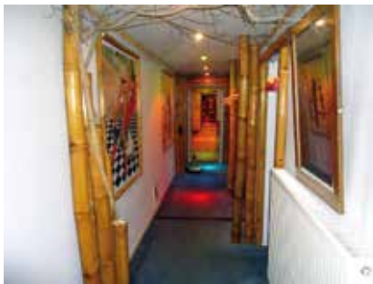
Big Bamboo Coridor

„We are a very liberal club, so you, too, should accept bisexuality in both sexes as natural. Many people enjoy it. Bisexuality should be accepted in every regard. You may