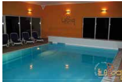
Le Coq Indoor pool

bar in the fireplace room, complete with smoke filter and fresh air supply. Anywhere else, smoking is not allowed.