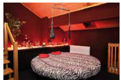
Swingerworld Inside Studio