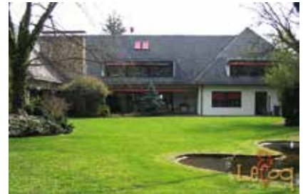
Le Coq Outdoor area