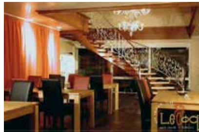
Le Coq Dining area