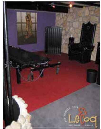
Le Coq BDSM-area