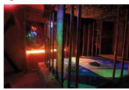
Big Bamboo Playground and cage