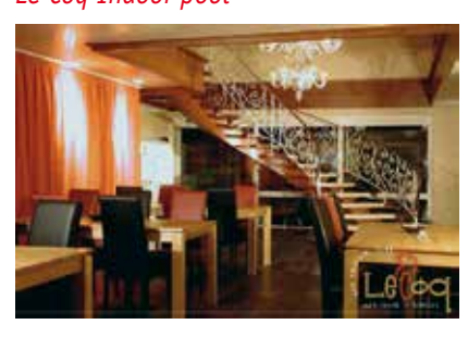
Le Cog Dining area