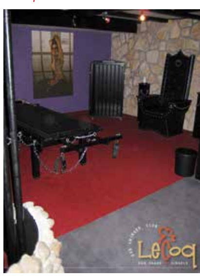
Le Coq BDSM-area