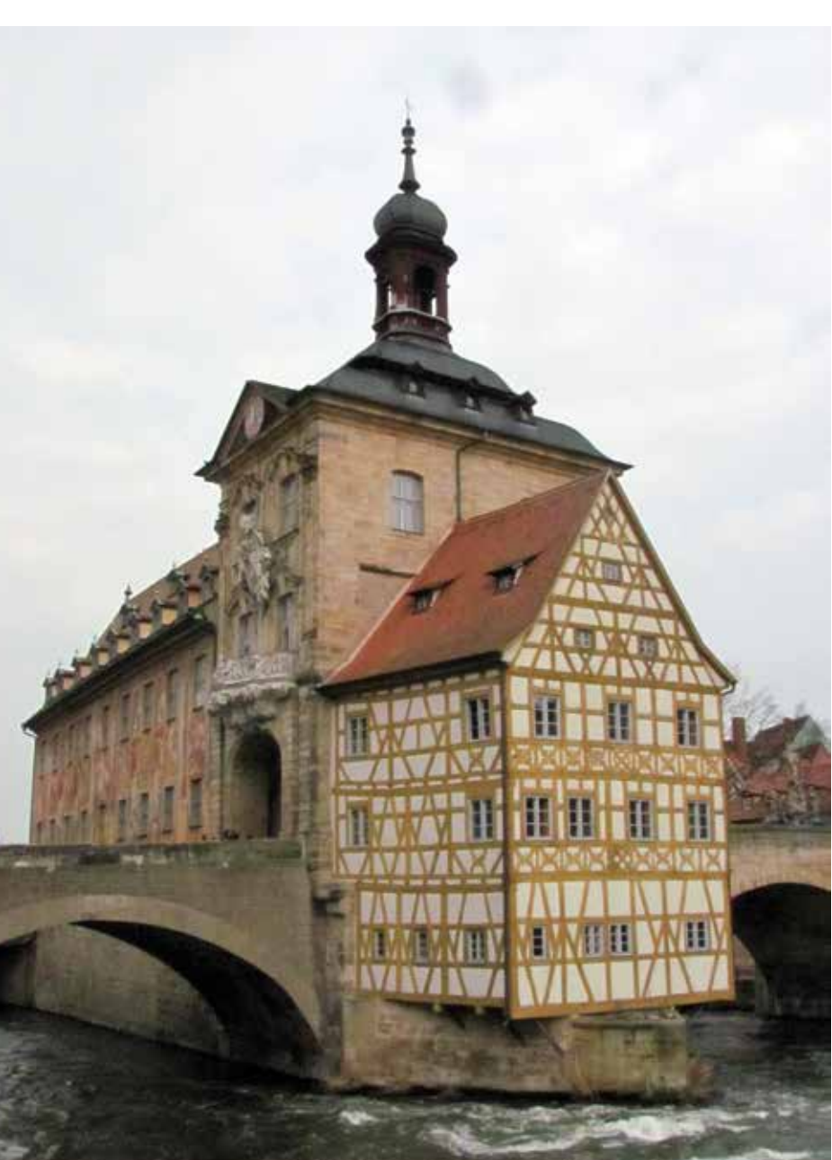
Bisexuality and Baroque -Bamberg's town-hall too is located between the banks

times when the only sex shop in town was pudently called "Specialised shop for conjugal health articles" have long gone. Surely, gay and lesbian life flourishes mostly in obscurity and is certainly more provincial than in Berlin or other metropoles. Yet, the small and a museum where Baroque, beer and catholicism have lively scene has something to offer. Plus, since July 2013, a bi group exists in Bamberg.