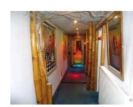
Big Bamboo Coridor

"We are a very liberal club, so you, 34,99€€. too, should accept bisexuality in both sexes as natural. Many people enjoy it. Bisexuality should be accepted in every regard. You may