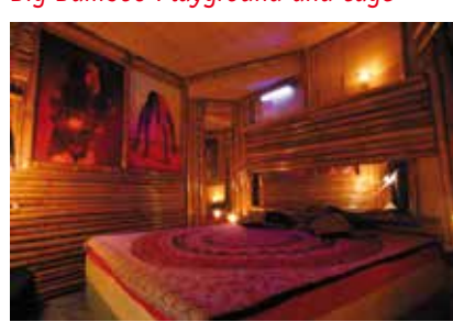
Big Bamboo Room

will not make you gay or lesbian. It's not contagious, either" (current pricing, women: € 4,99, men: 29.99-39.99€, couples: 19.99-