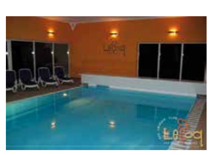
Le Cog Indoor pool

bar in the fireplace room, complete with smoke filter and fresh air supply. Anywhere else, smoking is not allowed.