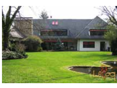
Le Cog Outdoor area