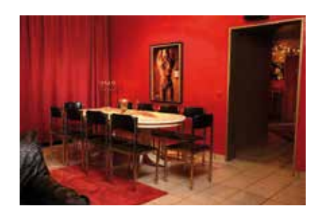
Swingerworld Inside Dinette

Bi guests are welcome at all party events (current pricing, women: 5€, men: 80€, couples: 30-40€€. Guests are free to enjoy their bi preference without any "Already in 2006, we introduced inhibitions. We adhere to the nonsmoking law, but there is an outside area with a heated smoking pavilion.