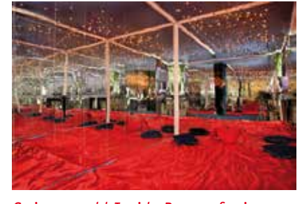
Swingerworld Inside Room of mirrors