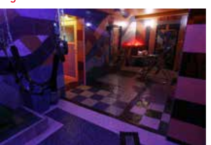
Bia Bamboo Wet area