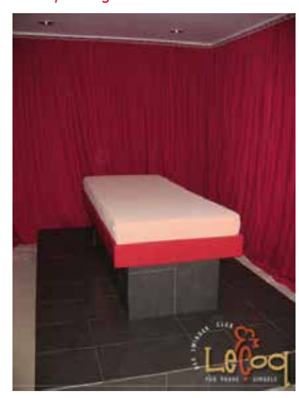
Le Coq Playground