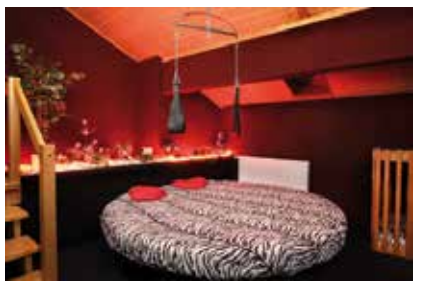
Swingerworld Inside Studio