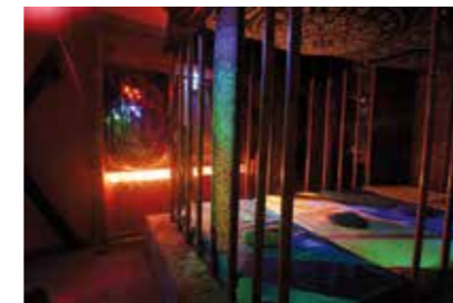
Big Bamboo Playground and cage