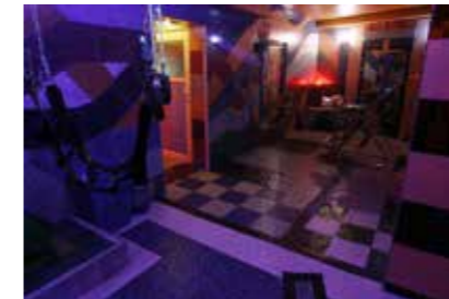
Big Bamboo Wet area