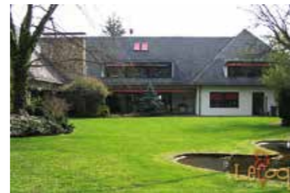
Le Coq Outdoor area