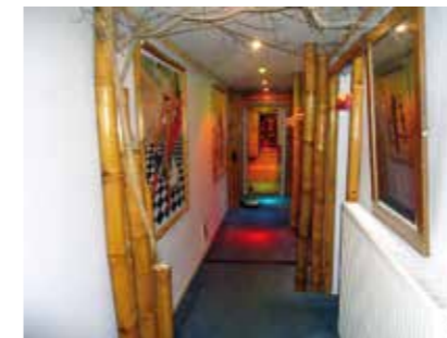
Big Bamboo Corridor

„We are a very liberal club, so you, too, should accept bisexuality in both sexes as natural. Many people enjoy it. Bisexuality should be accepted in every regard. You may