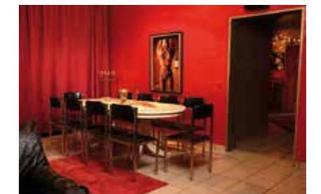
Swingerworld Inside Dinette

Bi guests are welcome at all party events (current pricing, women: 5€, men: 80€, couples: 30-40€€). Guests are free to enjoy their bi preference without any inhibitions. We adhere to the non-smoking law, but there is an outside area with a heated smoking pavilion.