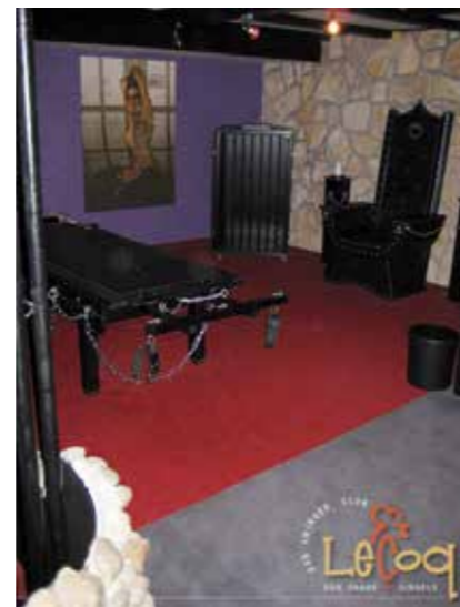
Le Coq BDSM-area